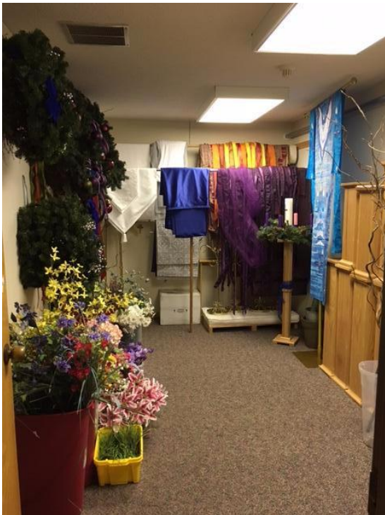
Newly Organized Worship Closet