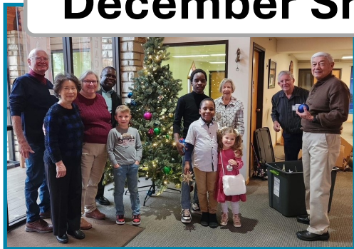
The Trimming of the church Christmas tree and the church building.