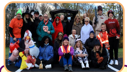
Photo: 2021 Candy & Caring

Trinity will once again host the Candy & Caring sprinter event on Sunday, Oct. 27, from 1-3pm . Trick-or-treaters in the community will donate non-perishable food items for entry to the event. Volunteers who sign up, will host a "Trunk-of-Treats" in Trinity's lot. During Trinity's 1st year hosting (2021), the church was visited by 400+ guests 31 grocery bags of food was collected for the local food shelf! Sign up in the office to join the event. Please note: Trinity is looking for one volunteer organizer for the sprinter event. Can you help? Contact the office with questions.